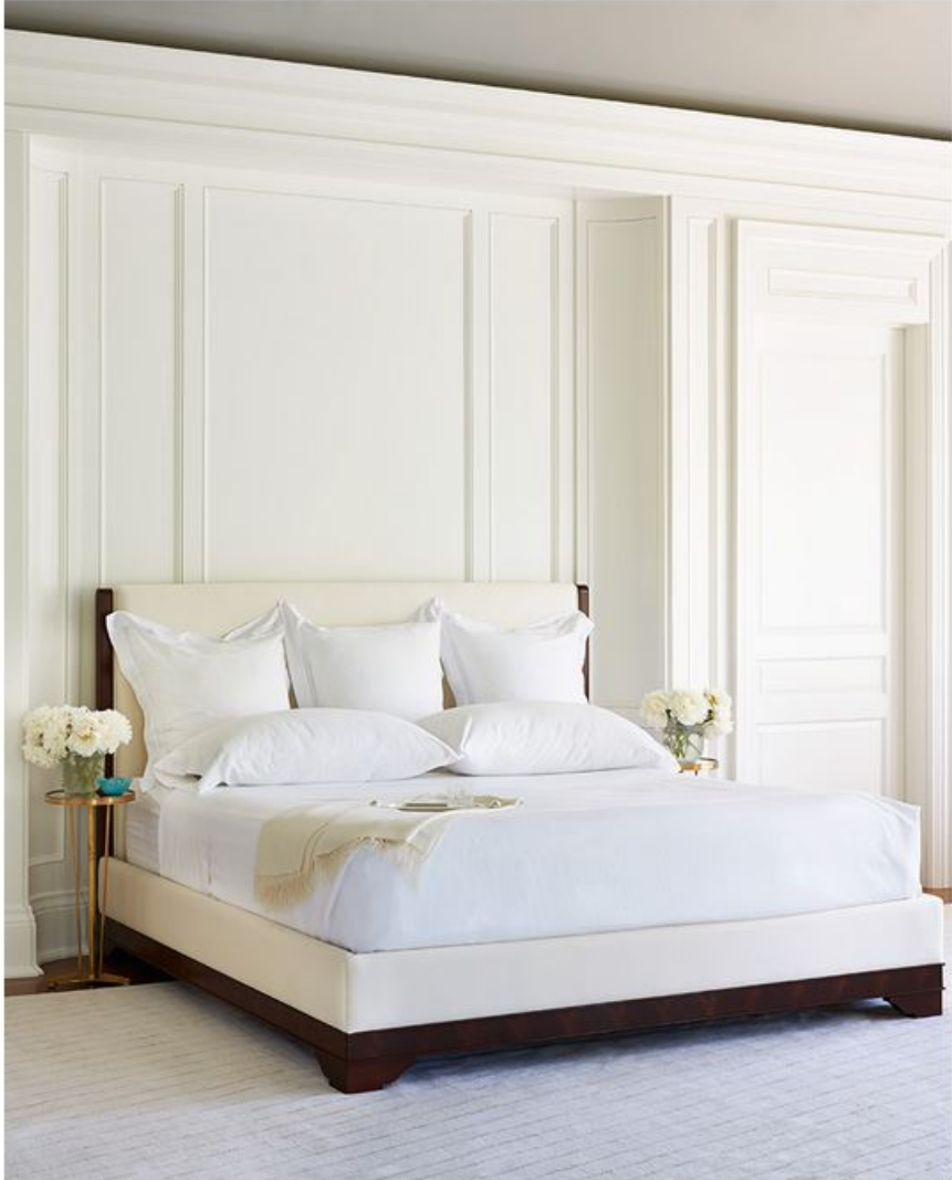
(The Valentine Bed by Plum Furniture)