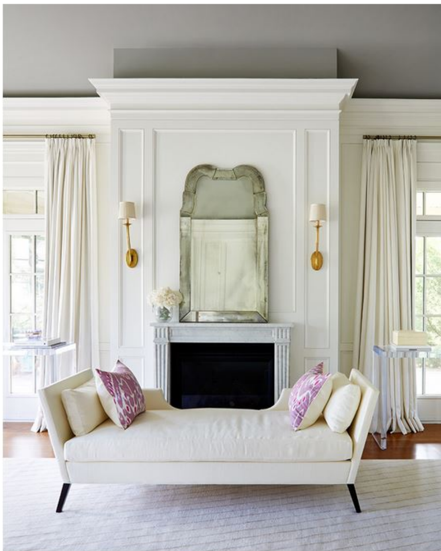
(The Sandra Napper Chaise by Plum Furniture.)